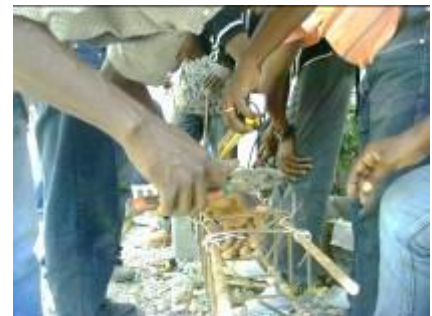
MTPTC engineers learning how to bend stirrups during retrofit training