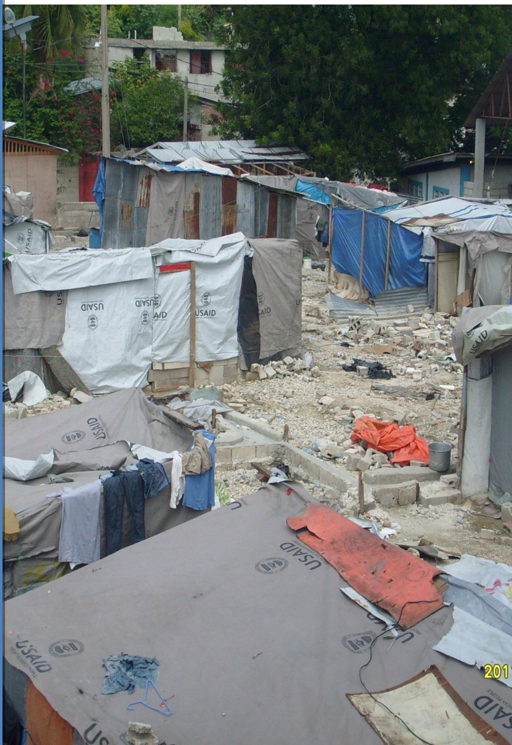
Figure 1: Concern facilitates the return of camp residents to communities

AIDG Architecture for Humanity BGR Group Build Change Child Relief International Concern Worldwide Habitat for Humanity International Haven Partnership IDLO IFRC International Action JPHRO New York University SOIL (Sustainable Organic Integrated Livelihoods) The Garnet Group TC Capital Turner Construction Company Un Techo para Mi Pais Water.Org