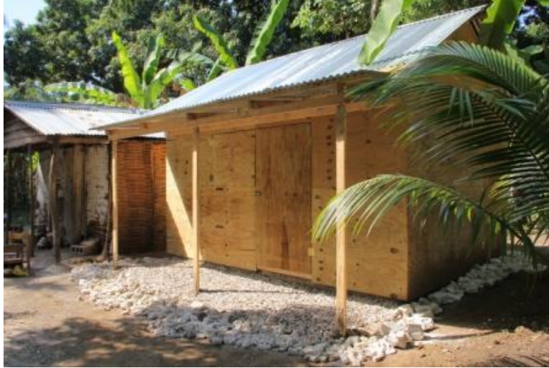
Habitat's upgradable shelter