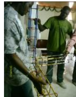
Participants in builders training in St. Marc