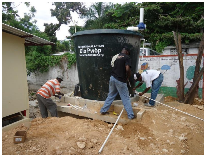
International Action technicians installing a 2,000-gallon water tank and chlorinator at an AIR sponsored school.

In addition to community interventions, International Action installed 12 chlorinators and 2,000-gallon tanks in schools through its partnership with the American Institute for Research. All of the installations were completed in the month of May, increasing students' access to clean water. Please see below for school names and location.