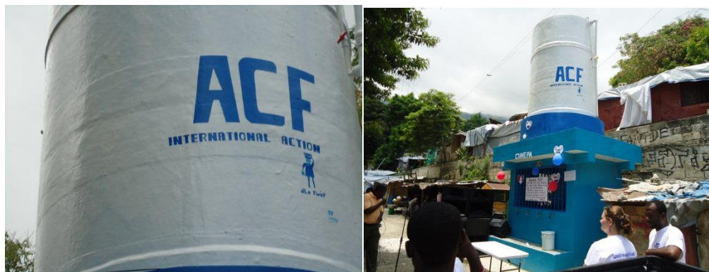
ACF an International Action inaugurated the restoration of a water tank and chlorinator in the neighborhood of Monjoie this May.

In collaboration with the DINEPA and partner organizations such as Action Contre la Faim and Le Comité International de la Croix Rouge , International Action experienced great success installing new chlorinators and restoring old ones that were damaged in the quake last year. In many cases, ACF or the CIRC restored the water tanks, DINEPA provided the water, and International Action installed the chlorinators to protect the residents.